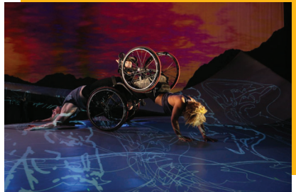
Lighting by Michael Maag

Remember: lanugage is important! Some people prefer to identify with identity-first language (disabled people) vs people-first language (person with a disability) unsure of how someone identifies? Ask!